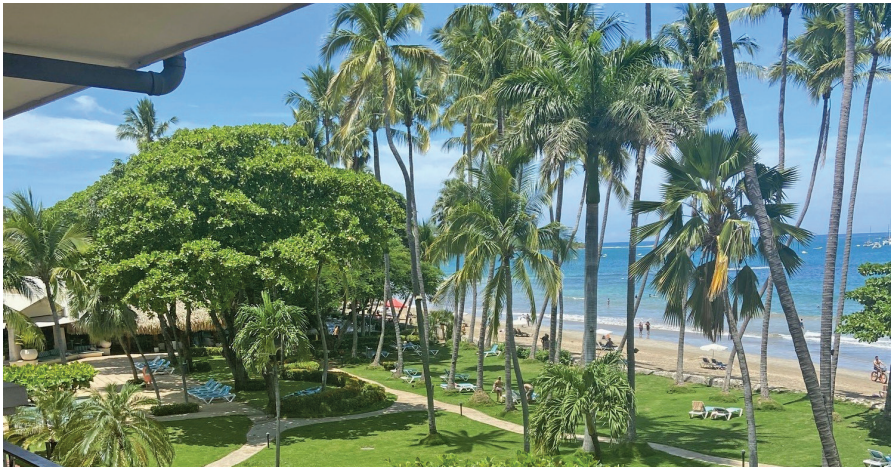
BEACH BUM – Palm trees, nicely manicured landscaping and a pristine beach hug the blue waters of the Caribbean Sea in Costa Rica.

We flew into Liberia airport and stayed at the Secrets Papagayo Resort – a stunning all-inclusive property with lush gardens on the gulf. The resort is large and hilly with a black-sand beach. It's a great getaway for clients who want an adults-only resort. It's a large spread-out property, not suitable if you have mobility issues. We also toured the nearby